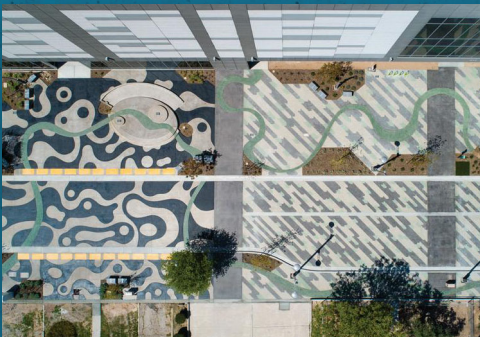
3rd Street Improvements, Phase 2 T.B. Penick & Sons, Inc., San Diego, CA

Questions: Contact Bev Garnant @ 314-962-0210