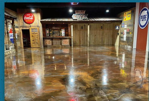
P&M Mechanical Birmingham Decorative Concrete, Leeds, AL