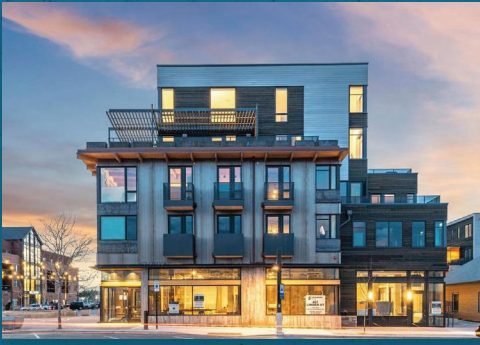
Confluence Coloscares Concrete, Loveland, CO