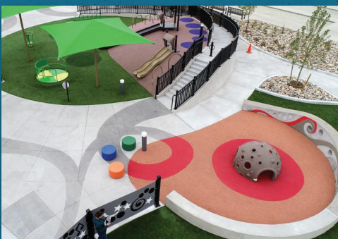
Red-Tailed Hawk Inclusive Playground Colorado Hardscapes, Greenwood Village, CO

If there are fewer than three entries in any category, that category may not be judged. Entry fees will be refunded.