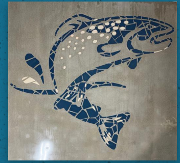
Kalkaska Trout Inlay Fisher Companies, Midland, MI