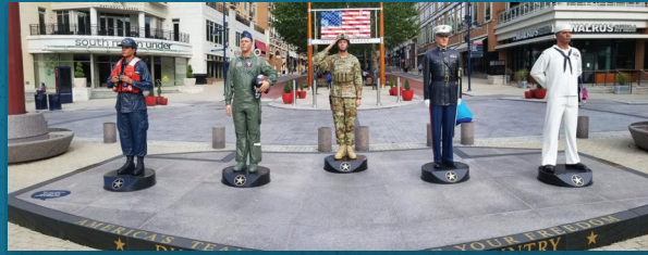
National Harbor Showcase Intersection Salzano Custom Concrete, Aldie, VA