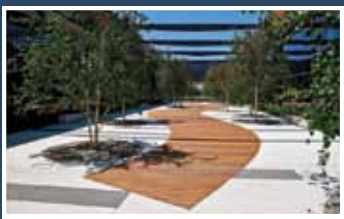
CAST-IN-PLACE, SPECIAL FINISHES Over 5000 SF – 1st Place Project: The Reserve Contractor: Trademark Concrete Systems, Inc.