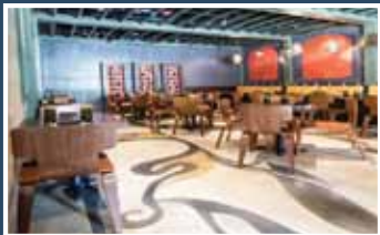
GRAPHICS Under 5000 SF – 1st Place Project: Kapnos Contractor: Hyde Concrete