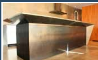
COUNTERTOPS (TIE) 2nd Place Project: Staab Kitchen Contractor: Architectural Concrete Interiors LLC