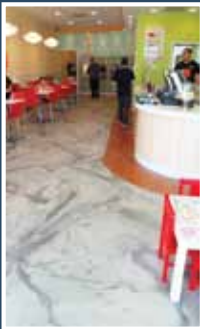
EPOXY-POLYASPARTIC FLOORING Under 5000 SF 2nd Place Project: Tutti Frutti Restaurant Contractor: Sundek of Washington