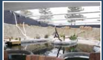
VERTICAL APPLICATION Under 5000 SF – 2nd Place Project: Penguin Pool - National Aquarium Contractor: Angus McMillan Concrete Ltd