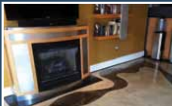
STAINED Under 5000 SF – 2nd Place Project: McCullough Residence Contractor: Sundek of Washington