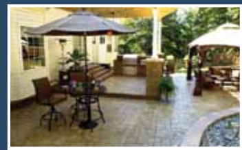
CAST-IN-PLACE, STAMPED Under 5000 SF – 1st Place Project: Harmonious Oasis Contractor: Greystone Masonry, Inc.