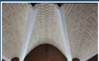
CONCRETE ARTISTRY Over 5000 SF – 1st Place Project: FR2 Contractor: Concrete Innovations, LLC