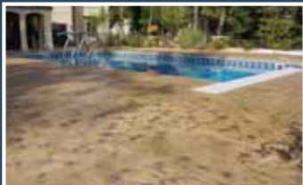
STAINED Over 5000 SF – 2nd Place Project: Reinhart Residence Contractor: Nobel Concrete, Inc.