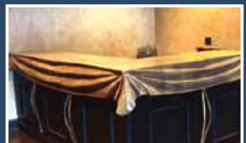
COUNTERTOPS (TIE) 2nd Place Project: Morrison Ballroom Bar Contractor: Adams Trucking & Supply