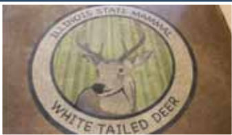
POLISHED Over 5000 SF – 1st Place Project: Kennekuk County Park Environmental Education Center Contractor: Creative Construction By Design