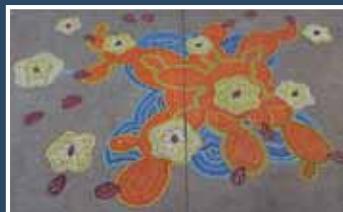
CONCRETE ARTISTRY Under 5000 SF – 1st Place Project: Tuscon Streetcar Station Contractor: Progressive Hardscapes