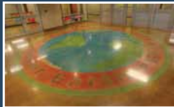
GRAPHICS Over 5000 SF – 1st Place Project: Big Sandy Elementary School Contractor: Jeffco Concrete Contracting, Inc.