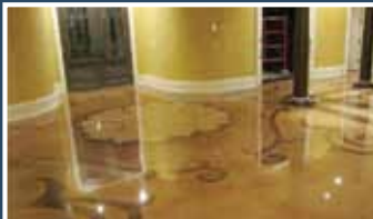
OVERLAYS, 1/4" – 2" Under 5000 SF – 2nd Place Project: Godsey Chattanooga Contractor: Concrete Mystique Engraving