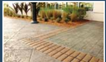
CAST-IN-PLACE STAMPED Over 5000 SF – 2nd Place Project: Florida Turnpike Centers Contractor: Edwards Concrete Company