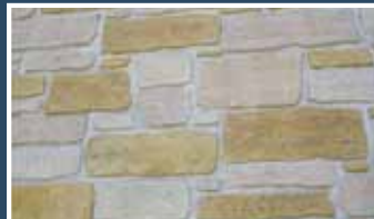
STAINED Over 5000 SF – 1st Place Project: Eden Park Pump Station Contractor: Patterned Concrete of Cincinnati