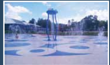
OVERLAYS, Less Than 1/4" Over 5000 SF – 2nd Place Project: Bithlo Splash Pad Contractor: Sun Surfaces of Orlando