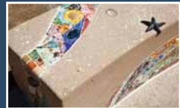
MULTIPLE APPLICATIONS Over 5000 SF – 1st Place Project: Highway 101 Contractor: T.B. Penick & Sons, Inc.