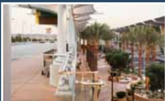
ARCHITECTURAL CONCRETE Over 5000 SF – 2nd Place Project: San Diego Airport Contractor: T.B. Penick & Sons, Inc.