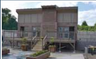
VERTICAL APPLICATION Under 5000 SF – 1st Place Project: Tennessee Concrete Assn. - Net Zero Bldg. Contractor: Flex-C-Ment