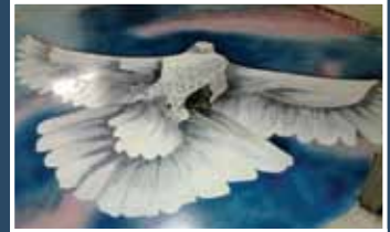
OVERLAYS, 1/4" – 2" Under 5000 SF – 1st Place Project: Charlotte Rescue Mission Contractor: Concrete Mystique Engraving