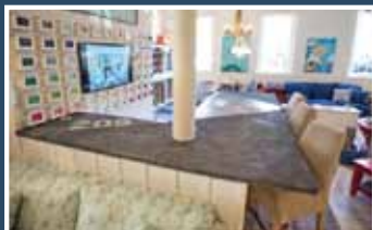
COUNTERTOPS 1st Place Project: Maine Cottage Contractor: Hyde Concrete