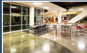
POLISHED Over 5000 SF – 2nd Place Project: Gordon Food Service Contractor: Burgess Concrete Constr., Inc.