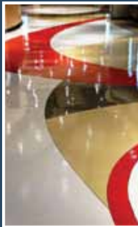
OVERLAYS, Less Than 1/4" Under 5000 SF 2nd Place Project: Micro-Top Contractor: Stephens and Smith Constr., Inc.