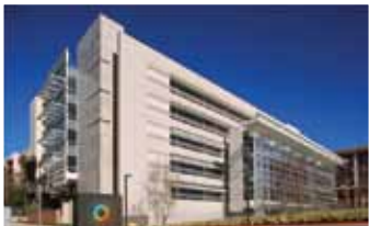
VERTICAL APPLICATION Over 5000 SF – 1st Place Project: Wasserman Building, UCLA Contractor: Morley Construction Company