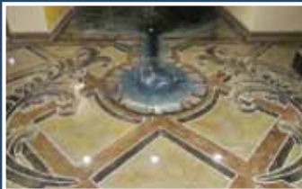
MULTIPLE APPLICATIONS Over 5000 SF – 2nd Place Project: Godsey Chattanooga Contractor: Concrete Mystique Engraving