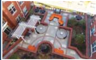
OVERLAYS, Less Than 1/4" Over 5000 SF – 1st Place Project: Dunn Loring Metro Contractor: Sundek of Washington