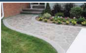
CAST-IN-PLACE, STAMPED Under 5000 SF – 2nd Place Project: Barry Residence Contractor: Salzano Custom Concrete