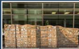
VERTICAL APPLICATION Over 5000 SF – 2nd Place Project: Mesa Math & Science Building Contractor: T.B. Penick & Sons, Inc.