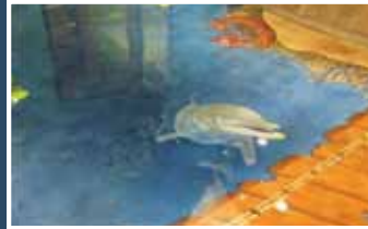
OVERLAYS, Less Than 1/4" Under 5000 SF – 1st Place Project: Brentwood Dental Contractor: Concrete Mystique Engraving