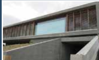
ARCHITECTURAL CONCRETE Over 5000 SF – 1st Place Project: Long Island Residence Contractor: Ruttura and Sons Constr. Co., Inc.