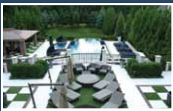
CAST-IN-PLACE, STAMPED Over 5000 SF – 1st Place Project: Livingston Residence Contractor: Unique Concrete