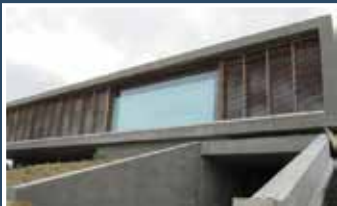
CAST-IN-PLACE, SPECIAL FINISHES Over 5000 SF – 2nd Place Project: Long Island Residence Contractor: Ruttura and Sons Constr. Co. Inc.