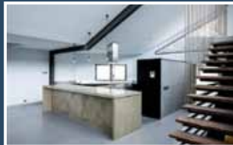
MULTIPLE APPLICATIONS Under 5000 SF – 2nd Place Project: Burnett Residence Contractor: Honestone