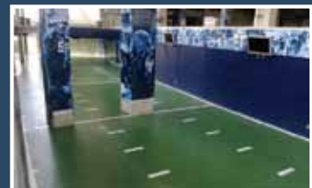
EPOXY-POLYASPARTIC FLOORING Over 5000 SF – 1st Place Project: LP Field Fun Zones Contractor: Concrete Mystique Engraving